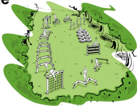
Artists Impression of what maybe Included: Tyre Run, Gate Climb, Parallel Bars, Multi-Exercise Bench, Net Climb, Over & Under Hurdles, Bunny Hops, Horizontal Ladders, Heaves & Leaving Heaves